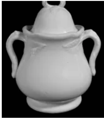
Lily Shape (Calla Lily)