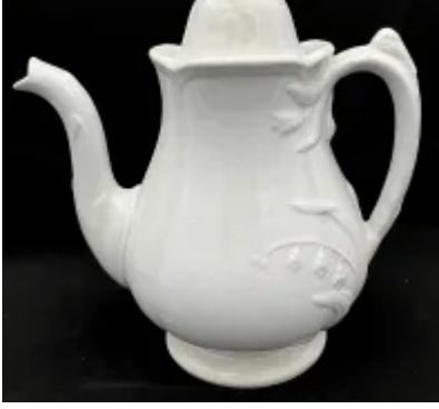
Lily Shape (Bordered Hyacinth)