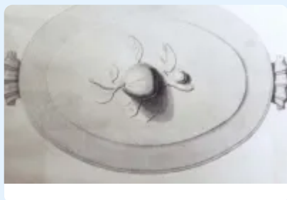
Vegetable Tureen Base and Lid