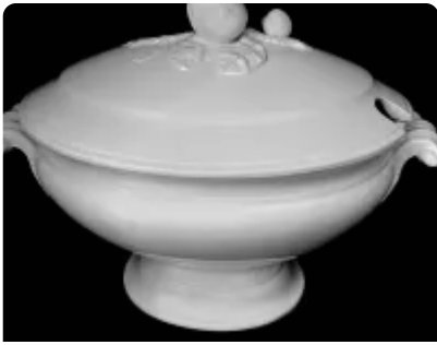
Barrow & Co.