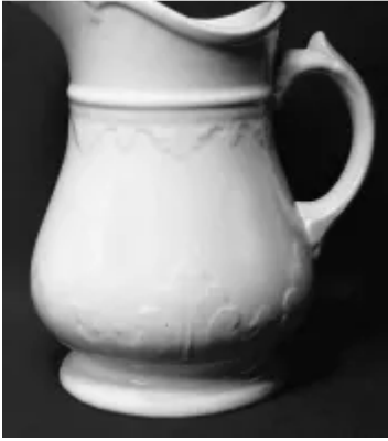
Podmore, Walker, & Co.