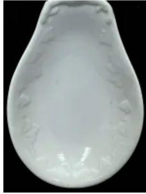
Wedgwood & Co.