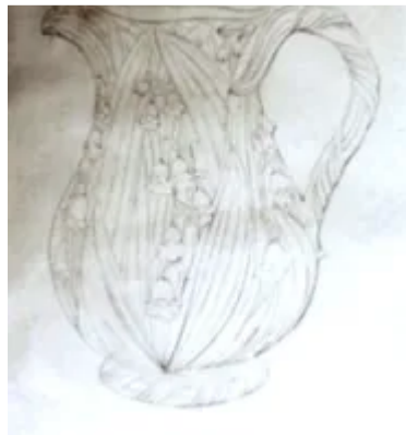
Lily of the Valley