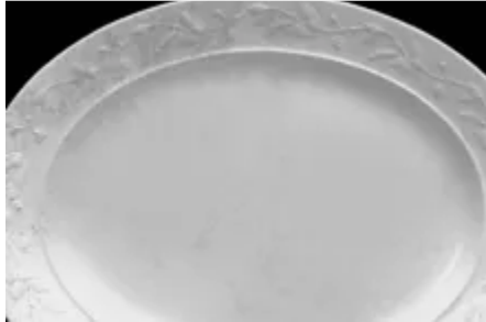
Pea Pod with Vine