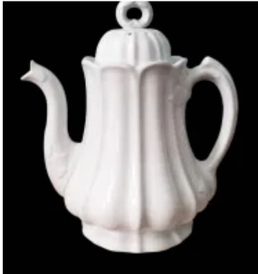
Pearson's #5 Shape