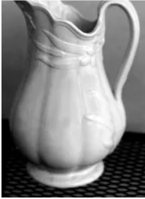
Wheat and Hops